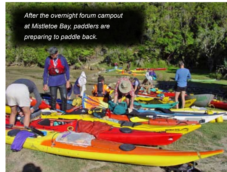
After the overnight forum campout at Mistletoe Bay, paddlers are preparing to paddle back.

For more information see www.kask.org.nz and go to the events page or contact Evan at sheepskinsstuff@xtra.co.nz